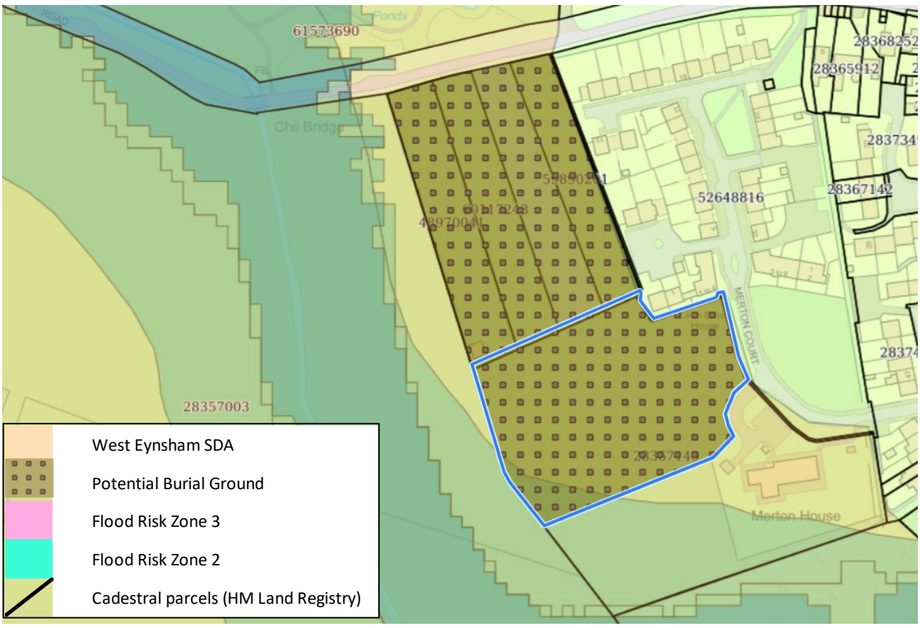
Map 2 showing land ownership (cadastral parcels registered with HM Land Registry) and proximity to flood zones.

The site is 0.8456ha approx. At the current rate of burials, this equates to 104 years of use. However, the average burial rate will increase due to the West Eynsham population which will reduce this usage period.